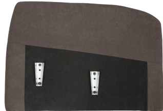
2x Recliner Side Panels